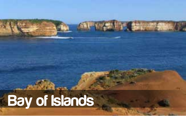
Bay of Islands