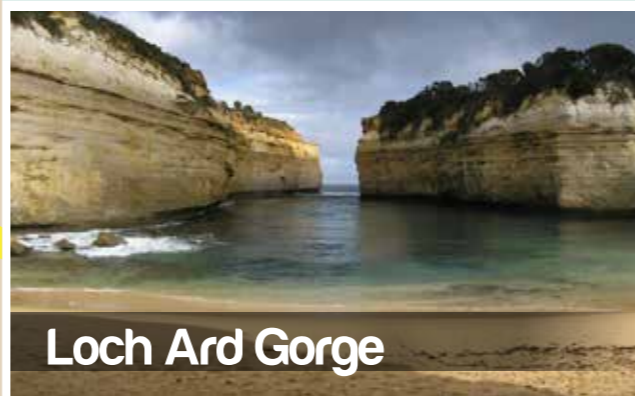
Loch Ard Gorge